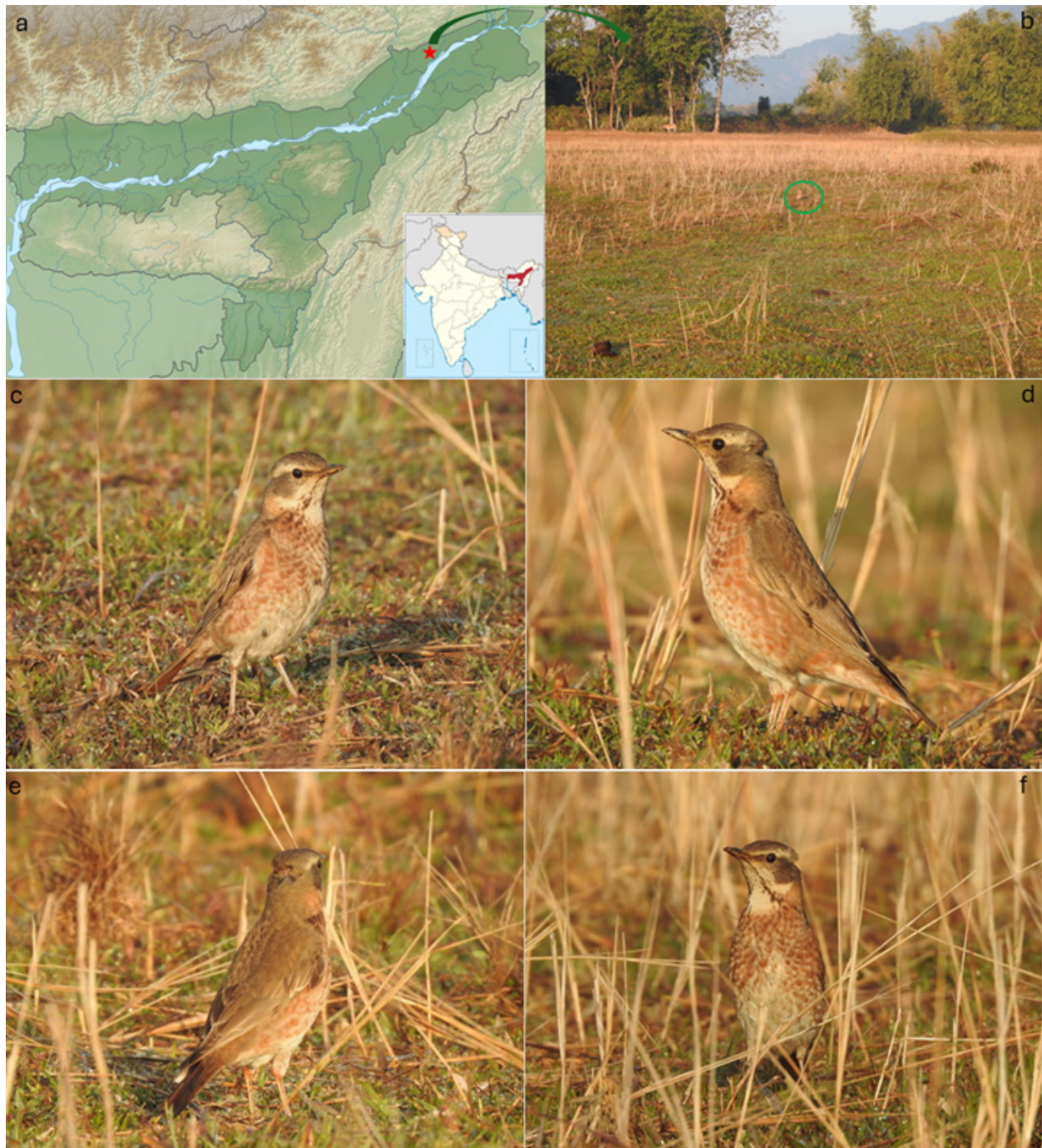
Image 1 . Naumann's Thrush Turdus naumanni recorded from Dhemaji District of Assam: a—Map showing the sighting location (red star) | b—Feeding habitat with green circle indicating the individual's position | c-f—Field photographs illustrating diagnostic morphology from multiple angles | c—Right lateral view | d—Left lateral view | e—Dorsal view | f—Frontal view, supporting species identification and absence of hybrid characters.

(1) rufous-orange wash extensively covering the breast, flanks, and undertail coverts; (2) pale supercilium extending from lore to nape; (3) brown-rufous (not black) streaking on the upper chest and malar region; (4) pale brown (not dark brown) upperparts with rufous