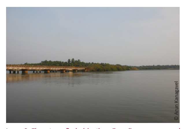
Image 2. The estuary flanked by the railway line, mangrove and coconut plantations at the Kadalundi-Vallikunnu Community Reserve