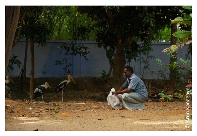
Image 4. The forest department staff employed from the local community feeding juvenile painted storks rehabilitated at the Thirupaddaimaradur Conservation Reserve