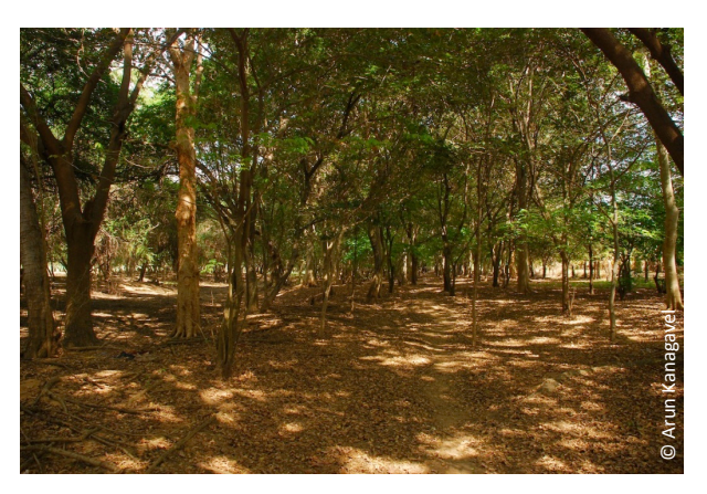
Image 5. The resultant vegetation of the decade-long planting initiative at the Thirupaddaimaradur Conservation Reserve

asked regarding whether and how the FD officials, researchers and local communities were involved in reserve declaration. The respondents were then asked about reserve management, people involved in the management, how management plans were decided, and how the reserve management committee was chosen. Information on the frequency of committee meetings was also sought. Finally, respondents were asked to provide information on any difficulties that were faced with respect to the establishment or running of these reserves and whether they had any suggestions which could help in the setting up and implementation of similar reserves, elsewhere.