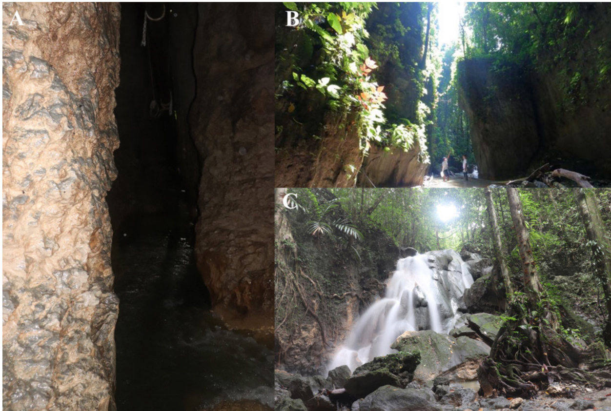
Image 3. Habitat of Rhinocypha togeanensis in Sungai Tanimpo. A—a narrow gorge in front of the forested area where this species was found | B&C—primary forest around the gorge with cascades and streamflow showing natural vegetation along the riverbank.

introduction of sand and soil into the stream represent the greatest threats to the survival of the species. No individuals of R. togeanensis were found near human settlements or agricultural areas (cacao plantation) up to Air Terjun Tanimpo, where this species was previously found. The habitat seems to have now been reduced to the upper part of the stream in forested areas. In some situations, damselflies (Zygoptera) have been reported to have a different community structure according to land change, thus sensitive to disturbance (Monteiro-Júnior et al. 2014). Since the natural flow of Sungai Tanimpo relies on the forested area upstream, deforestation or land use surrounding Sungai Tanimpo could affect that annual flow and water turbidity and cause problems to aquatic organisms that depend on a healthy stream. In addition, Sungai Tanimpo has also now become popular for recreational activities, especially at the waterfall. It is likely that in the future, the habitat of R. togeanensis inside the narrow gorge will also become a recreational site. To date, human activity in this area has only been for the regional drinking water supply (PDAM), affected by installing a long pipe from this area to the human