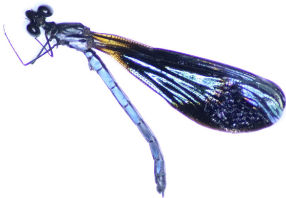
Image 2. A male of Rhinocypha togeanensis van Tol & Gunther, 2018 from Sungai Tanimpo, Batudaka Island, Togeian Islands.

bottom. The surrounding vegetation was dominated by primary forest.