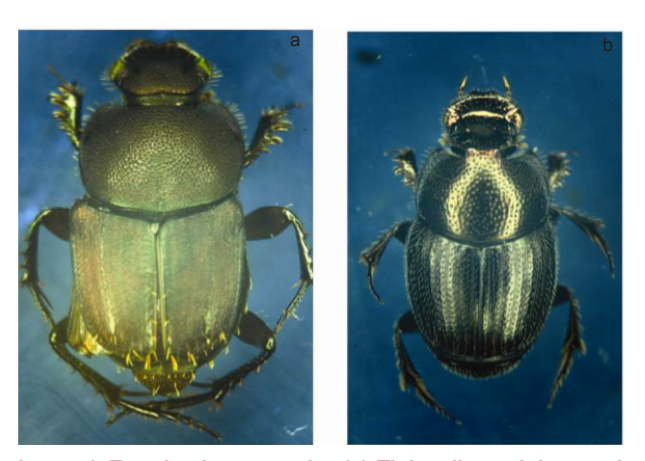
Image 1. Two dominant species (a) Tiniocellus spinipes and (b) Caccobius vulcanus present in the fragmented urban agricultural habitat during 2008–09 period.

dominance index value ( \lambda ) was 0.24 and evenness (1- \lambda ) was 0.751. Rank of each species based on relative abundance is represented in Fig. 1.