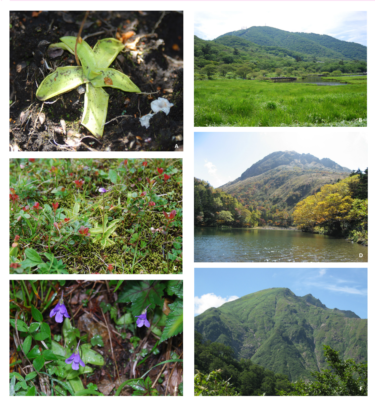
Image 1. Pinguicula species and their habitats in Gunma Prefecture: A, B— P. macroceras (16.vii.2018) and its habitat, Jizo-dake Peak in Mt. Akagi-yama; view from Kakumambuchi | C, D— P. macroceras (02.vii.2019) and its habitat, Mt. Nikko-Shirane-san | E, F— P. macroceras (07. vii.2019) and its habitat, Mt. Tanigawa-dake.

yama consists of a few peaks. The highest peak is a point at 1,961 m (no name for the peak), north of Ato-Kesamaru Peak (1,908 m). The species occurs on both Gunma and Tochigi sides of the mountain.