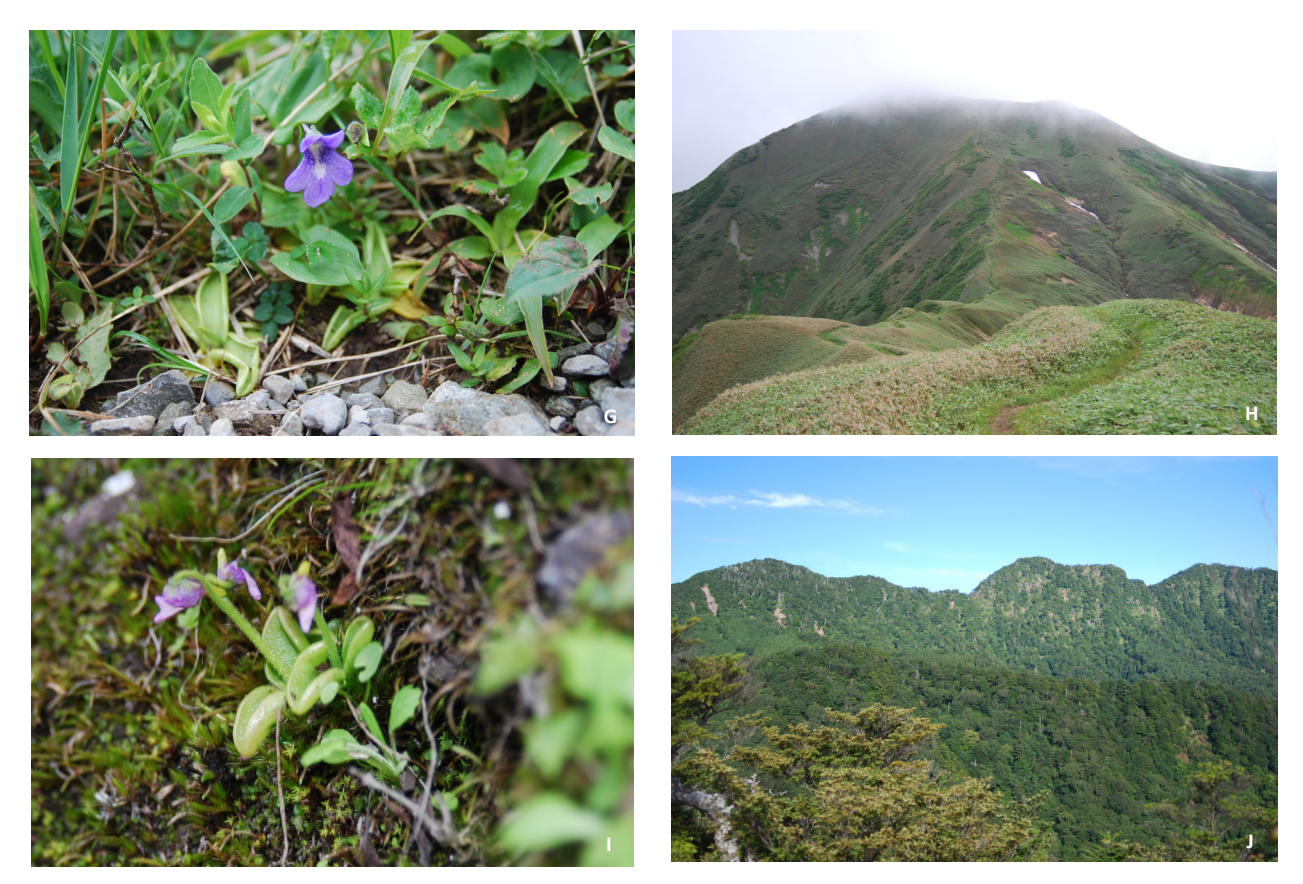
Image 1. G, H— P. macroceras (07.vii.2019) and its habitat, Mt. Ojikazawa-no-kashira | I, J— P. ramosa (06.vi.2019) and its habitat, Mt. Kesamaruyama; view from Tochigi side.

localities in Tochigi. The habitat receives direct sunlight in the morning, which may cause dry out the soil of the microhabitat. Minor collapses of the cliff seem to be relatively common, which may affect the habitat of the species. No P. macroceras has been found on Mt. Kesamaru-yama.