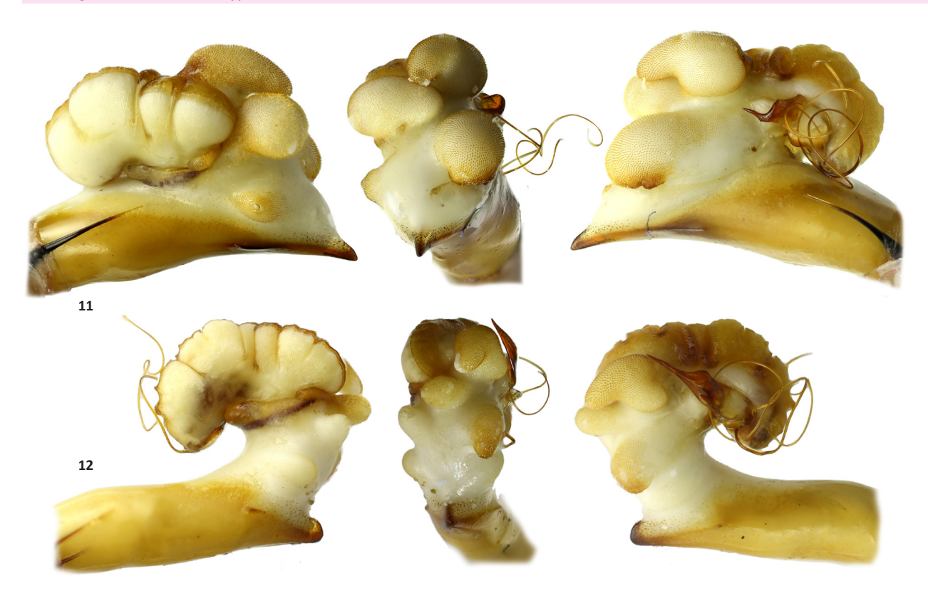
Images 11–12. Endophallus structure: 11–C. mindanaoensis | 12–C. lacrymosa (Mindanao, Zamboanga).

collected by Roland A. Müller in the Philippine Islands, with description of three new species (Coleoptera: Cicindelidae). Zoologische Mededelingen 73(33): 491–509.