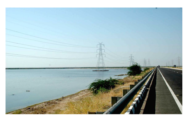
Image 4. Two parallel transmission line between Little Rann and Great Rann near Adesar, Kachchh.

Two incidences of collision were recorded at Vekariodhandh near Bhirandiyara, 50km north of Bhuj, on the Bhuj-Khavda road in Kachchh (Fig. 1, Table 1). On 14 January 2004, seven Greater Flamingos were found dead due to collision with the electric wire at this site (S.N. Varu pers. comm.). On 14 February 2004, two more dead Greater Flamingos were found at the same site in the morning hours. The bodies were slightly warm and not disturbed by predators. Such collisions are frequent at this particular site (Amin