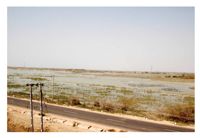
Image 3. Distribution line, telephone line and transmission line across a wetland.

power lines throughout the paper). The transmission lines were supported on giant structures. These specifications of electric lines were almost the same throughout the state. The height of the wires from the ground varied to some extent.