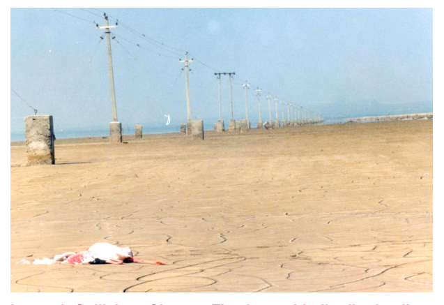
Image 1. Collision of Lesser Flamingo with distribution line at Shiranivandh