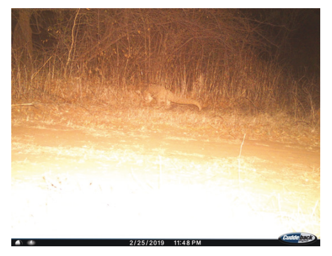
Image 5. Camera trap image of Indian Pangolin in Loj Beat, Talvriksh.