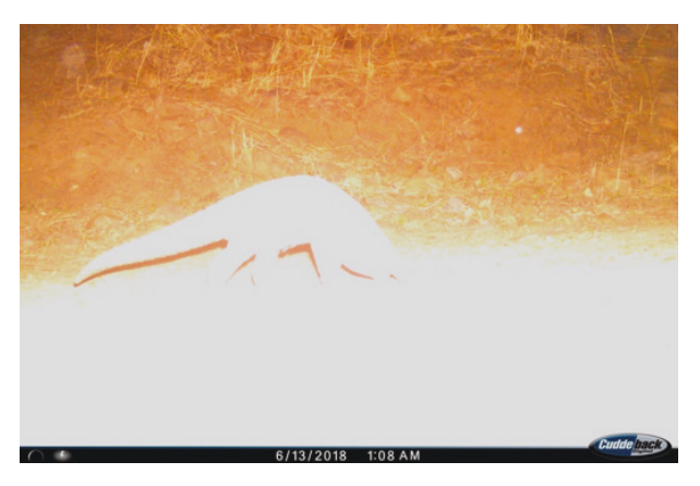
Image 3. Camera trap image of Indian Pangolin in Beat Jahaj, Tehla.