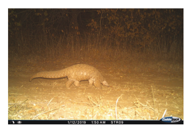
Image 4. Camera trap image of Indian Pangolin in Beat Jahaj, Tehla.