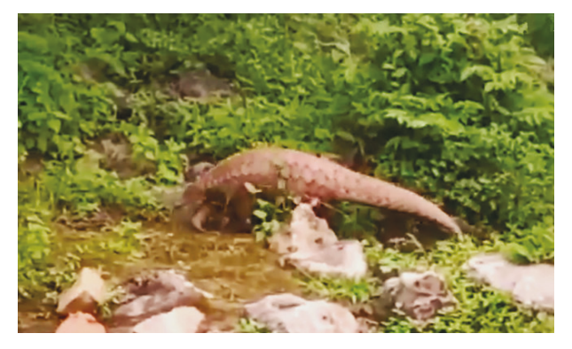
Image 6. Image clicked through mobile phone of Indian Pangolin, in Beat Loj, Talvriksha.