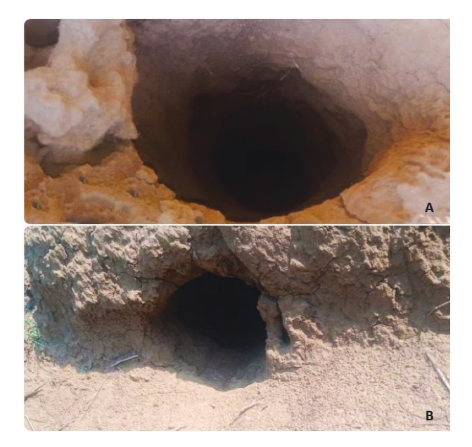
Image 7. Living burrows of Indian Pangolin: A—active burrow | B inactive burrow in beat Jahaj, Tehla.

night except for one individual which was observed in the morning.