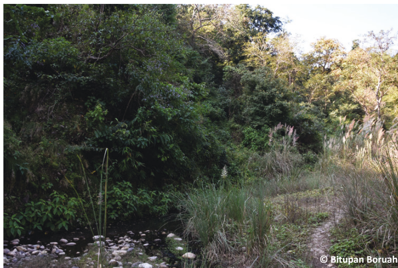
Image 2. Habitat at the location where Actinor radians was sighted.

record extend its range ca. 40km from nearest known location (Dehradun Valley) as well as first report of the species from the state of Haryana. The species was not reported in earlier studies by Sethy & Ray (2010) and Ranade (2017) from KNP. With the present record the number of butterflies of Kalesar National Park increases to 40. This report highlights the paucity of knowledge on faunal diversity especially lower taxa in the region as well as importance of the last remaining forest at the extreme end of the Terai Arc landscape.