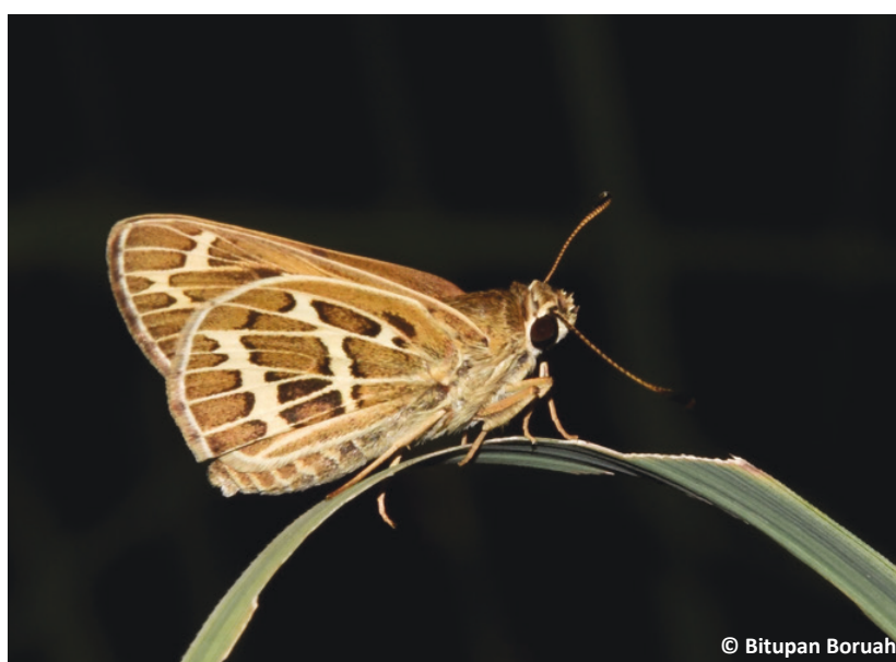
Image 1. Actinoradians (Moore, 1878) on grass blade of Saccharum bengalense .

of the hindwing originates immediately before the end cell; vein 5 of the hindwing distinctly traceable; vein 7 of the hindwing is close to end cell and originating at an acute angle; all the veins and discal bands pale yellow; antennae with slender club and sharp hook at the tip.