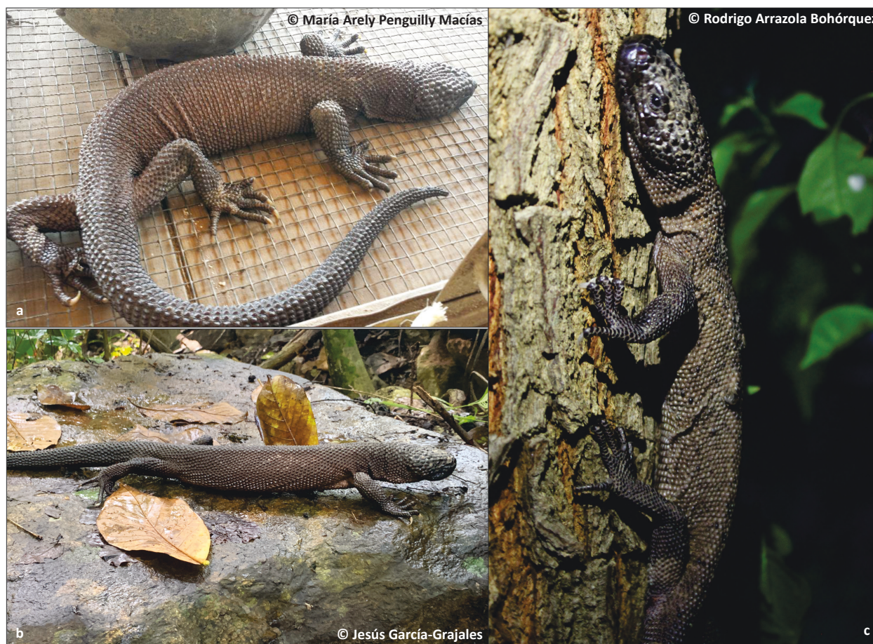
Image 1. Heloderma alvarezii in: a—Villa de Tututepec de Melchor Ocampo municipality | b—Santa María Colotepec municipality | c—Santa María Huatulco municipality.

juveniles often are distinctly marked with yellow spots and bands on the tail, but the color pattern of adults gradually transforms to an almost uniform dark brown or gray coloration.