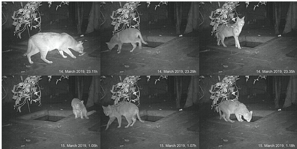
Image 2. Jungle Cat recorded in a residential area in the night of 14 to 15 March 2019.