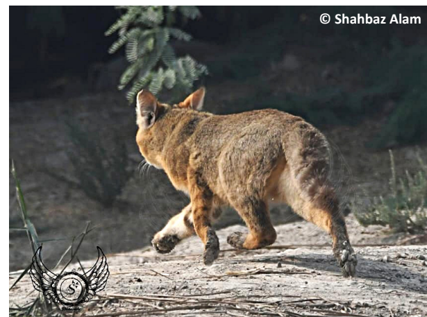
Image 4. Jungle Cat photographed in Langh Lake Wildlife Sanctuary.

The detection of only two other wildlife species may be due to the limitations of this survey, both in time and available equipment. The scent lure used in front of