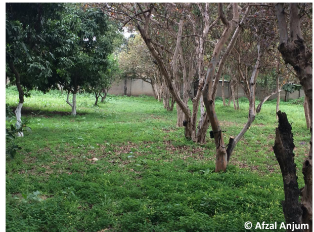
Image 1. Orchard around a camera trap location within the study area. This location is surrounded by residential buildings.

Two Bushnell Trophy HD camera traps (model Essential 119736 with infrared flash) were deployed with a distance of 500–900 m between locations. They were mounted at four locations at a height of 40–50 cm above ground. They were set to be active for 24hr and to take three consecutive photographs at an interval of one second. A scent lure for attracting furbearers (Kaatz