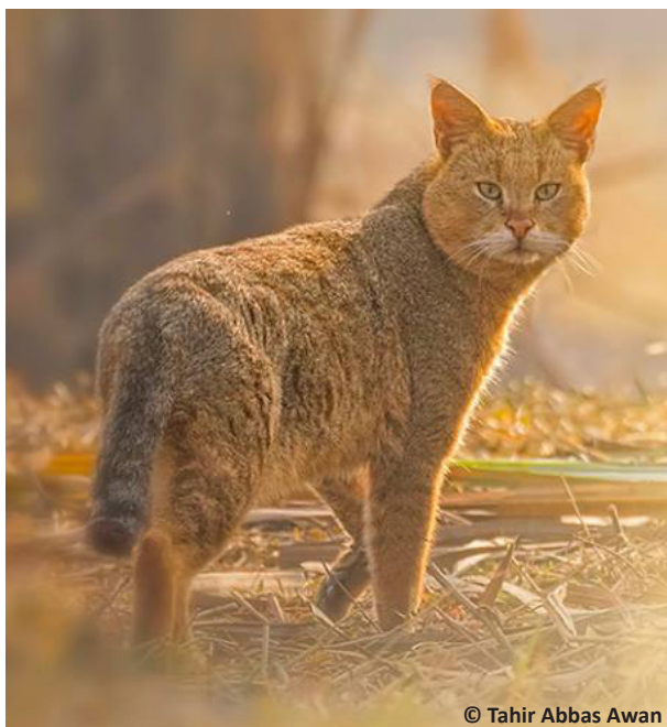
Image 3. Jungle Cat photographed in Sialkot District.