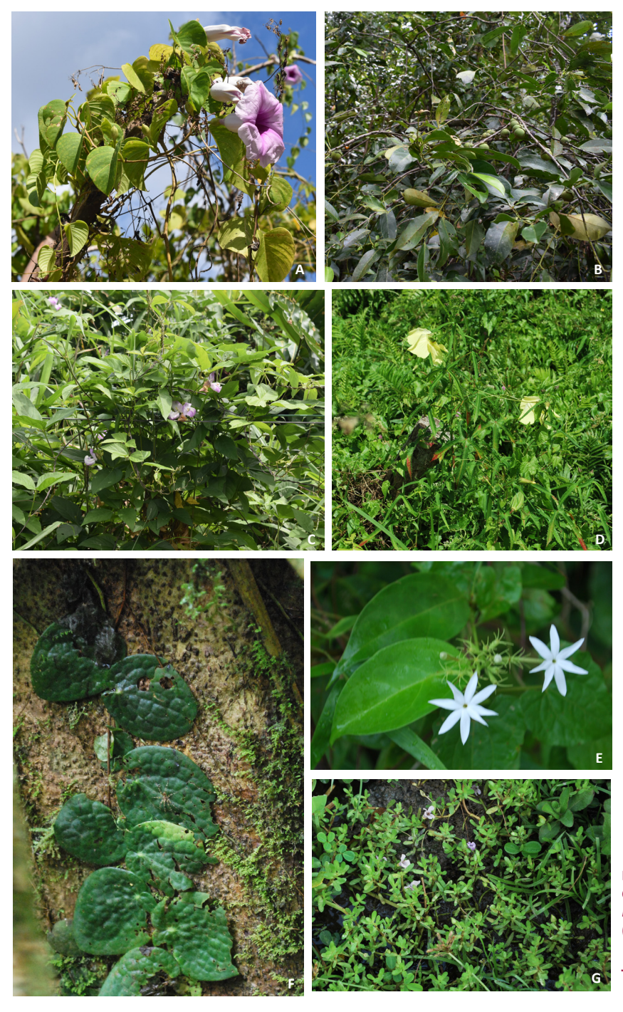
Image 1. Some new additions to the flora of Great Nicobar. A—Stictocardia tiliifolia | B—Diospyros undulata | C—Vigna adenantha (inset: inflorescence with immature pod) | D—Abelmoschus moschatus | E—Jasminum elongatum | F—Piper clypeatum | G—Bacopa monnieri.