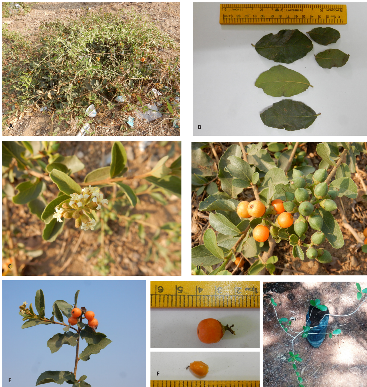
Image 1. Cordia diffusa K.C.Jacob: A—habit of the steno-endemic shrub | B—leaf morphology | C—close-up of inflorescence | D—a twig with immature and mature fruits | E—branch with flowers and fruits | F—close-up of a mature fruit and a seed (inset) | G—sapling from stem cutting.

inevitable actions to avoid the possible extinction in the near future.