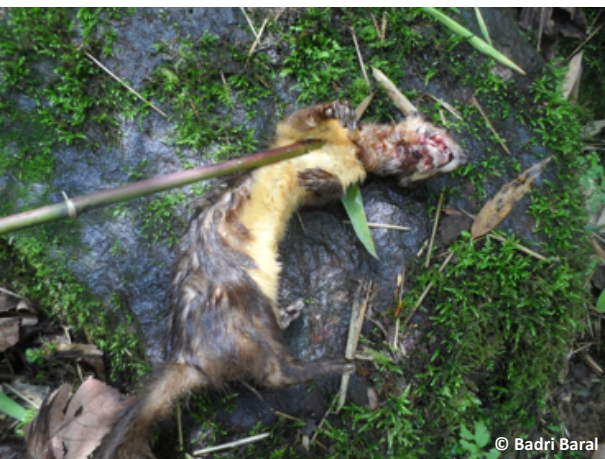
Image 2. Dead Mustela kathiah at Dhottachaur Community Forest, Barekot RM, Jajarkot.

Drepanostachyum falcatum, and Yushania sp. for their household requirements. Hunting of wildlife has been an inseparable part of the local inhabitants. The area is notorious for illegal and communal hunting and it occurs throughout the year with a peak during the Dashain festival and post monsoon season which has threatened the weasels' habitat. Traditional transhumance practice of livestock management is common in the region which further affects the weasel habitat in the region.