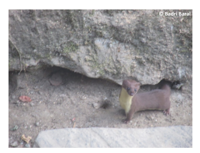
Image 1. Mustela kathiah at Lamsung, Dhaulagiri Rural Municipality, Myagdi.

observed, a Canon PowerShot SX170IS camera was used to capture the photograph of the species and Garmin etrex 10(model) GPS was used to mark the location where the species was observed. Also measurements were taken where possible.