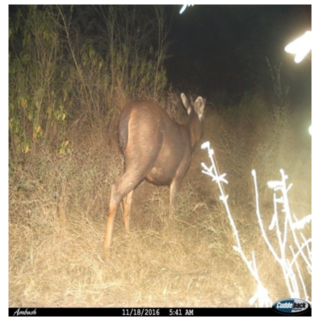
Image 1. Camera trap photos of Sambar from Bhondsi, Gurgaon.