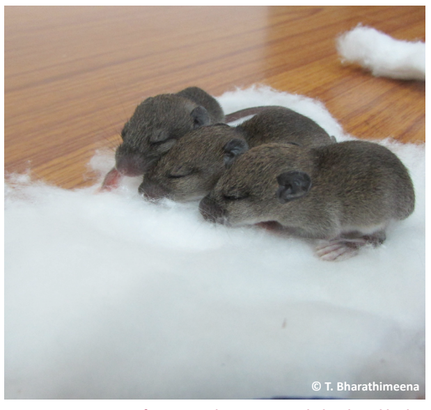
Image 2. Young ones of Rattus andamanensis with developed body hairs, ear pinna (age of puppies 15 days)