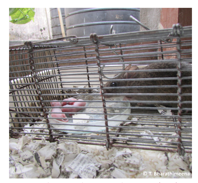
Image 1. Female Rattus andamanensis with young ones (age of puppies two days)

Rattus andamanensis is commonly known as Indochinese Forest Rat on the basis of its wide distribution in the Indochinese region. The characteristic features of the freshly collected specimens observed on the basis of morphological as well as cranial study are: Head and body length in the range of 110–190 mm. Tail unicolor, rough in texture and longer than Head & Body length in the range of 140–200 mm (120.8% of HB). Forearm and hind foot white in colour. Hind foot averages 35.9mm in length and about 25.5% of HB. Dorsum brown with gray base hair, spiny, intermixing with fine long black hairs and ventral portion of the body pure white and soft. Gray base with white tip (dirty white) patch in thoracic region found in the specimens R1, R4, R6, R8,