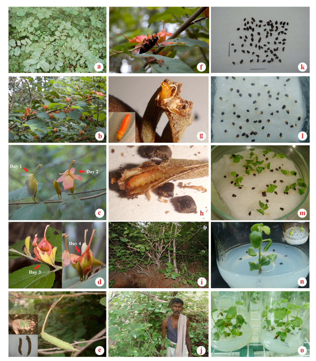
Image 1. Phenology, problems in fruit setting, distribution and in vitro seed germination of H. isora . a - H. isora habitat; b–d - flowering; e - fruits (fresh and dried); f - Blister beetle ( Mylabris pustulata ) eating flower of H. isora ; g & h - unidentified larvae presents inside H. isora fruit follicle feeding seeds; i - trimming of developing branches; j - local tribe in fruit collection; k - seeds from single matured fruit; I - seed germination in cotton bed; m - seedling development in cotton bed; n - seed germination and development in MS medium; o - germinated seeds developed in ½ MS medium.

of anomalies happened to flower by end of season and the developmental stages were hindered by changes in atmospheric climatic conditions unexpectedly. Over 35–