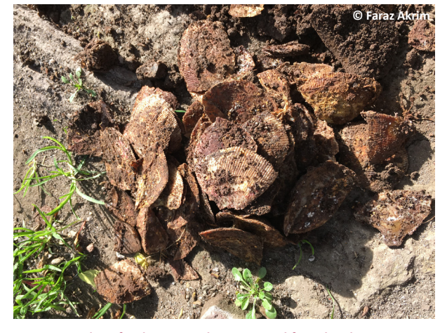
Image 4. Scales of Indian Pangolin recovered from locals in Pir Lasuara National Park

of respondents did not think so. It was statistically significant ( X^2 =161.43, df=1, p<0.001).