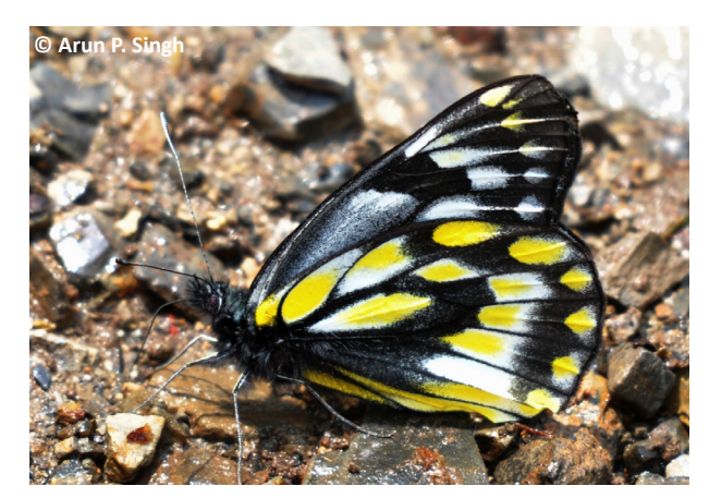
Image 8. Delias sanaca sanaca , female, normal form, near Suwakholi (~2000m), Uttarakhand, 22 May 2016 at 13:23hr.