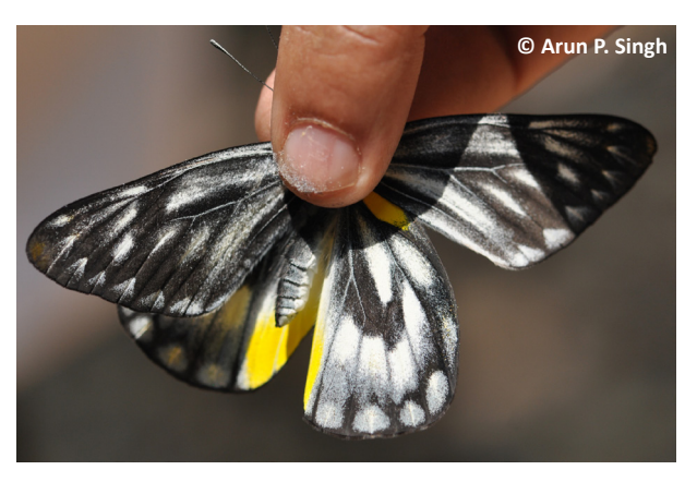
Image 7. Delias sanaca sanaca , female, normal form, near Suwakholi (~2000m), Uttarakhand, 22 May 2016 (close-up view of upperside).

about eight decades. D.s. sanaca occurs more commonly as the normal form 'sanaca' rather than as the 'pale' or 'dark' forms, which are rare. It was observed that in the forested habitats from where D.s. sanaca has been recorded, the oak trees are currently suffering