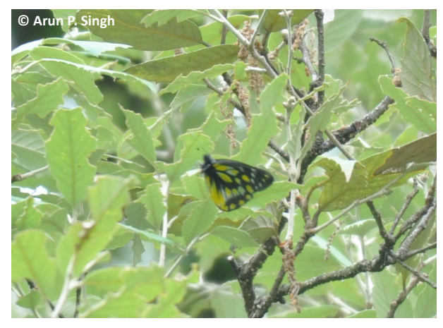
Image 11. Delias sanaca sanaca perched on ban oak, Quercus leucotrichophora, high above a stream.

moderate to heavy lopping by local villagers for fodder, which consequently results in removal of the putative food plant of this species, which is epiphytic on these oaks. The study suggests the need for conservation and protection of forested habitats of the Pale Jezebel, D.s. sanaca , in Garhwal, as well as the need to gather more data on this butterfly from the western Himalayan region in general to correctly assess its conservation status.