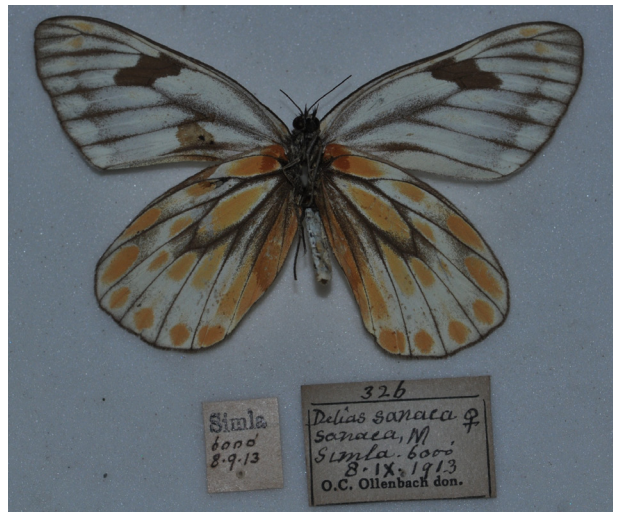
Image 2. Delias sanaca sanaca f. flavelba, female, Shimla, western Himalaya (NFIC, Forest Research Institute, Dehradun)

District of Himachal Pradesh). Moore (1903–1905) also mentioned P.W. Mackinnon collecting this species in openings of Moru Oak ( Quercus dilatata ) forest below Nag Tibba, north of Mussoorie town at 5,000ft (1,520m). Mackinnon also observed this species in the latter half of May and the beginning of June at Tehri Garhwal north of Mussoorie town at 8,500ft (2,590m). Moore (1903–1905) also made an observation on a female specimen collected at Mussoorie by Capt. T. Hutton, which was later deposited in the British Museum (now the Natural History Museum, London), and that one specimen of the 'pale form' was present in 'Hewitson's cabinet'. There are also reports of specimens of D.s. sanaca being 'plentiful' during the month of May during 1888, 1894