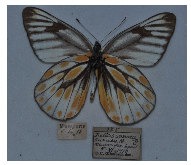
Image 1. Delias sanaca sanaca f. flavelba, male, Mussoorie, western Himalaya (NFIC, Forest Research Institute, Dehradun)