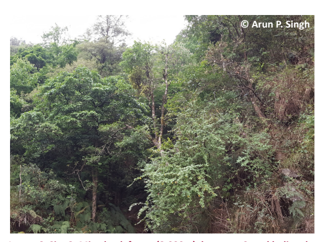
Image 6. Site 2: Mixed oak forest (2,000m), between Suwakholi and Rotu-ki-Beli, Tehri Garhwal, Uttarakhand, 28 May 2016.