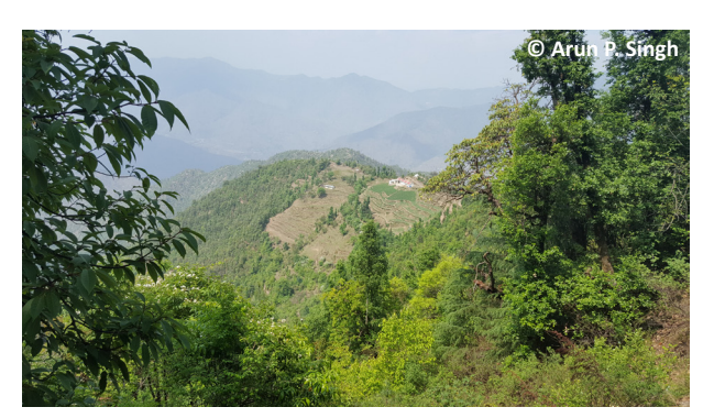
Image 5. Site 1: Mixed moist temperate forest near Dhanaualty (2,200), Tehri Garhwal, Uttarakhand, 3 June 2007.

The present findings confirm the occurrence of D.s. sanaca in the western Himalaya in India after a gap of