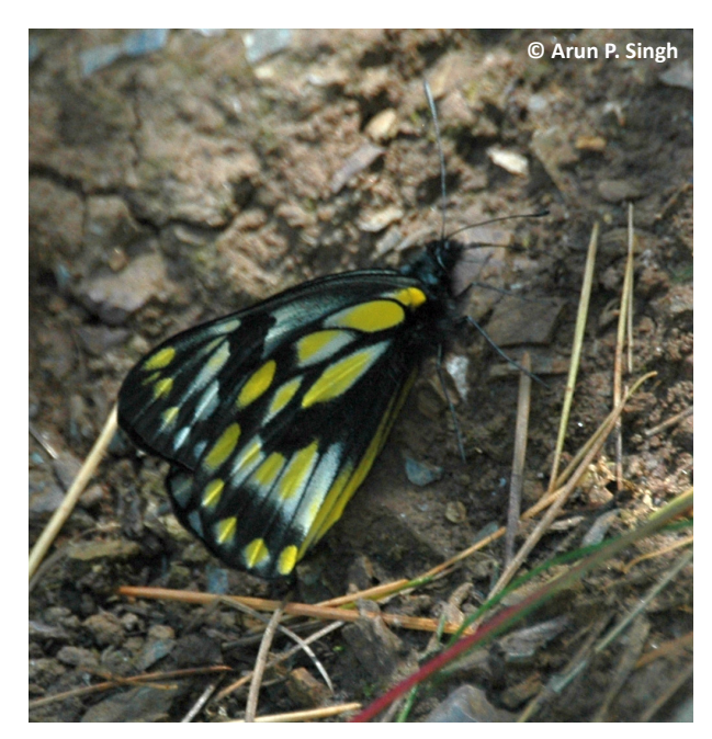
Image 4. Delias sanaca sanaca , male, normal form, near Dhanaulty (2,200m), Tehri Garhwal, east of Mussoorie, Uttarakhand, 3 June 2007 at 13:04hr.

first record, three individuals were recorded together in flight and then mud puddling on wet sand. The habitat (Site 2; Image 6) was a mixed patch of Moru Oak-Deodar forest at ~2000m. The butterflies (Images 7 & 8) were recorded during afternoon (12:30h-14:00h) along a 'nullah' with running water on a steep hillside. This locality is 3km north of Suwakholi, on the road to Rotuki-beli. Suwakholi is 15km east of Mussoorie Town.