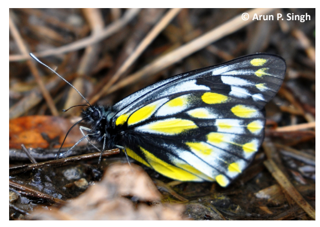
Image 9. Delias sanaca sanaca , male, normal form, near Suwakholi (~2000m), Uttarakhand, 28 May 2016 at 13:56hr.