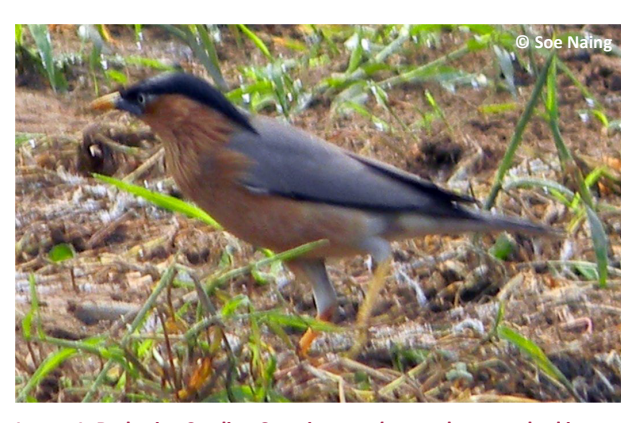
Image 1. Brahminy Starling Sturnia pagodarum photographed in October, 2012 within the campus of Myeik University, Tanintharyi Region, Myanmar.

The new record from southern Myanmar complements seventeen locality records from Thailand. These are listed in Table 1 and mapped in Fig. 1. They extend from Kanchanaburi Province in western central Thailand, south to Pattani Province on the Malaysian border. They are primarily based on sight records by a variety of individuals, which have been collated by Phil Round (pers. comm. 2015). A number of these records, including some with photographs, have also been posted on the BCST (Bird Conservation Society of Thailand) website (BCST 2015a) and on the website http://eBird.org; a minority are listed in Wells (2007). In addition to Thailand, there is one record from Siem Reap Province, Cambodia (eBird 2007) and two recent