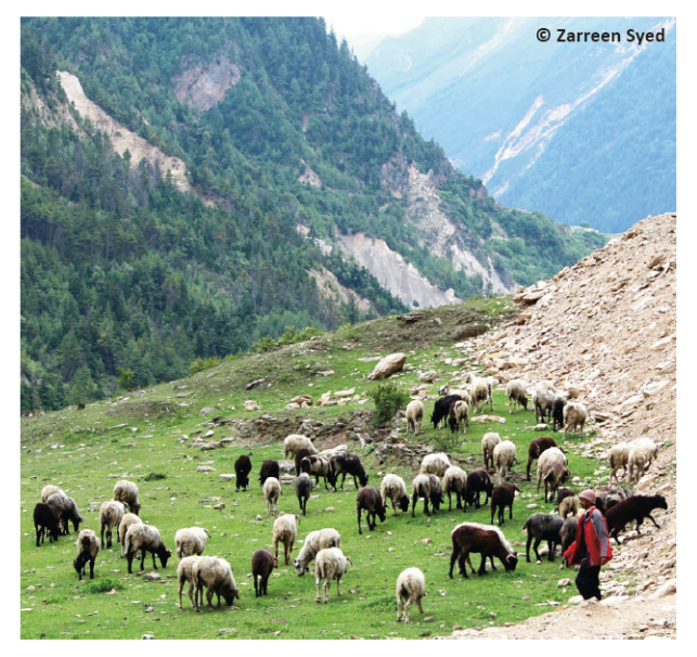
Image 1. Exemplary livestock grazing in the natural habitat of Himalayan ungulates in Byans Valley on Indo-Nepal border.

The co-existence and spatial or trophic resource partitioning among populations of native wild species of ungulates have developed through evolutionary processes over millions of years (Voeten & Prins 1999). In the modern scenario, however, with rapidly increasing human population around the world, the environmental conditions of ecosystems are changing at a pace that doesn't give enough time for resource partitioning to evolve between wild ungulates and their domestic counterparts. More humans result in the need for more livestock for their sustenance and these increased numbers of livestock intrude into the wild habitats which impose the additional pressure on the limited resources available for wild ungulates in the region (Putman 1996; Voeten & Prins 1999). Theoretically, species populations can grow until resource availability is reduced to the point of resource limitation (threshold point) and after that point the population growth rate is balanced by mortality (Huisman 1997). Livestock however are supplementarily fed by their owners and therefore their populations can continue to grow beyond this threshold; a process called overstocking (Mishra et al. 2001). In the case of high overlapping of habitat and forage requirements of livestock and wild herbivores, the overstocking of livestock may cause competitive exclusion of the wild herbivores (Mishra et al. 2002; Bagchi et al. 2004).