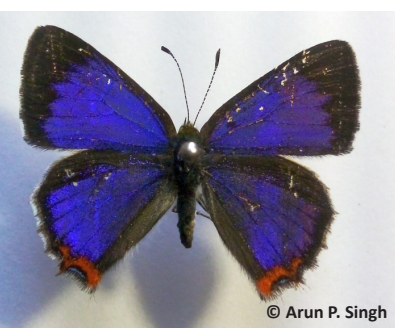
Image38b. Eastern Blue Sapphire Heliophorus oda (male upper side)— Suwakholi