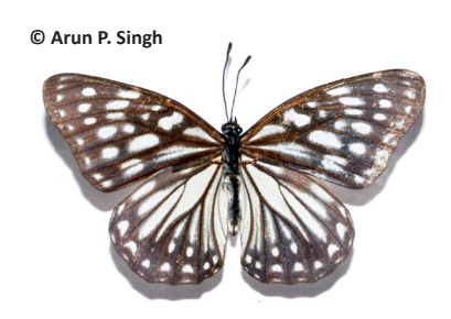
Image 27. Siren Hestina persimilis zella (Upperside)—Maldeota, Dehradun Valley