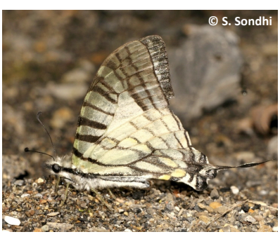
Image 1b. Six-bar Swordtail Graphium euros cashmierensis—Woodstock School, Mussoorie