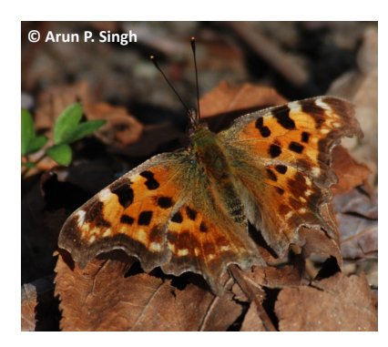
Image 30. Eastern Comma Polygonia c-album —Sankri, Taluka, Govind Wildlife Sanctuary