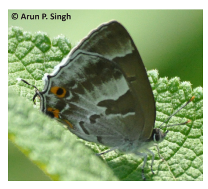
Image 9a. Wonderful Hairstreak Thermozephyrus ataxus ataxus (female)— Kedarnath Musk Deer Reserve (Arun P.Singh)