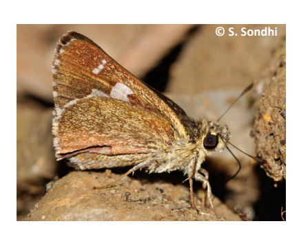
Image 35. Mussoorie Bush Bob Pedesta masuriensis masuriensis—Chakarata Hills