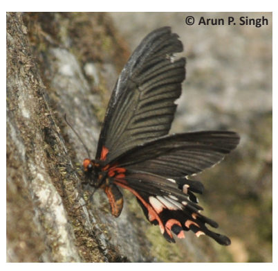
Image 2. Tailed Redbreast Papilio bootes janaka—Kedarnath Musk Deer Reserve