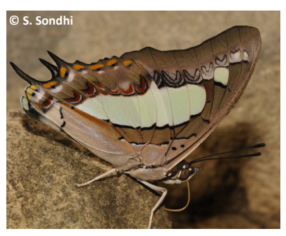
Image 29. Anomalous Nawab Charaxes agrarius agrarius—Saneh, Sonanandi Wildlife Sanctuary