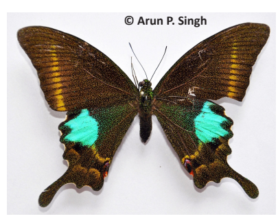
Image 4. Paris Peacock Papilio paris paris — New Forest campus, Dehradun Valley