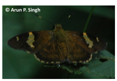
Image 34. Himalayan Yellow-banded Flat Celaenorrhinus dhanada—Kedarnath Musk Deer Reserve