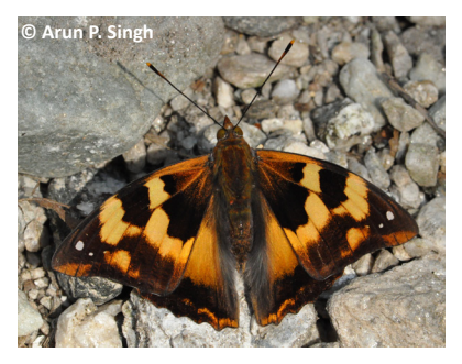
Image 25. Golden Emperor Dilipa morgiana —Kedarnath Musk Deer Reserve