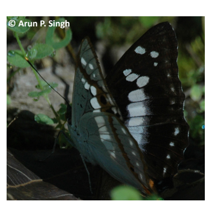
Image 24. Indian Purple Emperor Apatura ambica ambica—Kedarnath Musk Deer Reserve