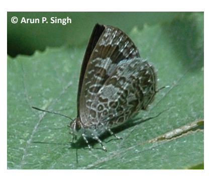
Image 13. Dusky Bushblue Arhopala paraganesa paraganesa—Kedarnath Musk Deer Reserve