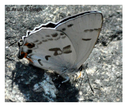
Image 9b. Wonderful Hairstreak Thermozephyrus ataxus ataxus (male)— Kedarnath Musk Deer Reserve