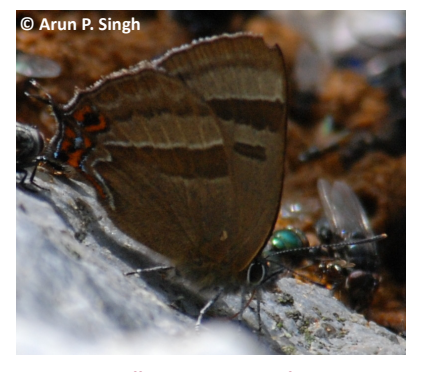
Image 10. Dull Green Hairstreak Esakiozephyrus icana icana—Near Deoban, Chakarata