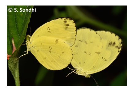
Image 6. One-spot Grass Yellow Eurema andersoni jordani—New Forest Campus, Dehradun