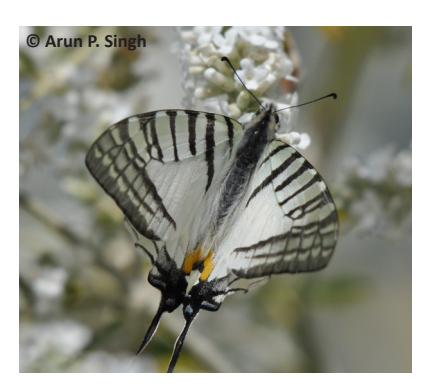
Image 1a. Six-bar Swordtail Graphium euros cashmierensis—Mussoorie