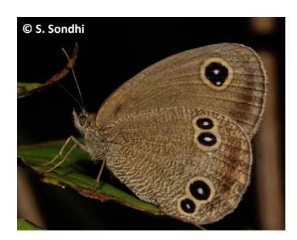
Image 20. Brown Argus Ypthima ( Dallacha ) hyagriva hyagriva —Magra RF, Tehri Garhwal