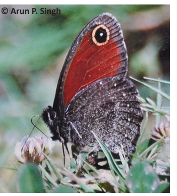
Image 21a&b. Scarce Mountain Argus Callerebia kalinda (Upper side) & (Under side)—Dhanaulty, Tehri Garhwal