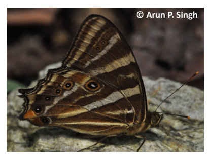
Image 18. Treble Silverstripe Lethe baladeva aisa—Kedarnath Musk Deer Reserve