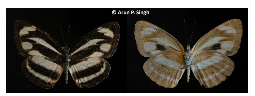
Image 31 a&b. Pale Green Sailer Neptis zaida zaida (Upper side &Under side)—Dhanaulty, Mussoorie