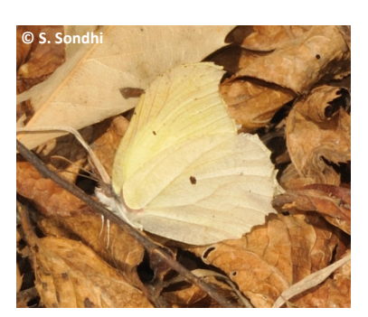
Image 5. Lesser Brimstone Gonepteryx mahaguru mahaguru—Deoria Tal in Kedarnath Musk Deer Reserve