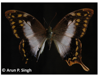
Image 3. Brown Gorgon Meandrusa lachinus lachinus —Kedarnath Musk Deer Reserve