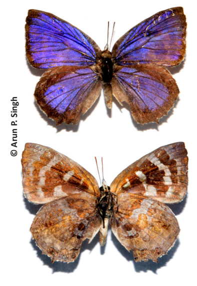
Image 14a&b. Spangled Plushblue Flos asoka female (Upper side) & (Underside)