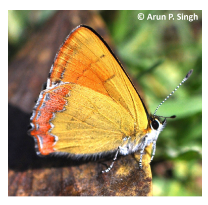
Image 38a. Eastern Blue Sapphire Heliophorus odα (male)—Suwakholi near Mussoorie