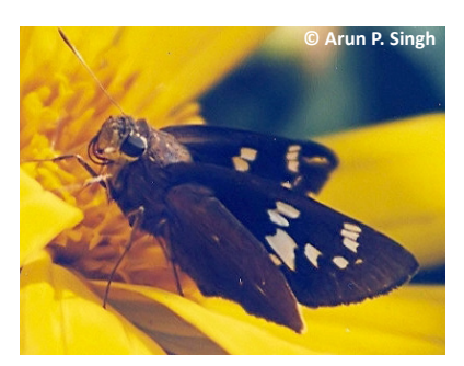
Image 37. Conjoined Swift Pelopidas conjuncta conjucta—New Forest Campus