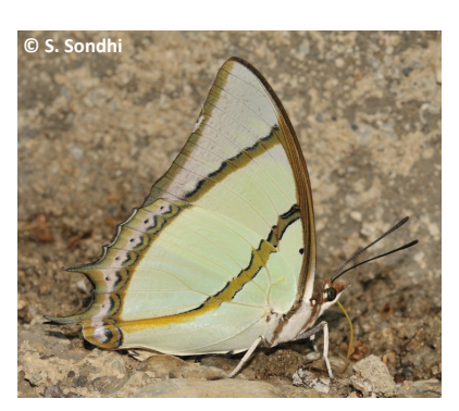
Image 28. Stately Nawab Charaxes dolon dolon —Magra RF, Tehri Garhwal