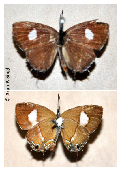
Image 16a&b. Brown Onyx Horaga viola (Upperside) & (Underside)—New Forest Campus, Dehradun Valley.