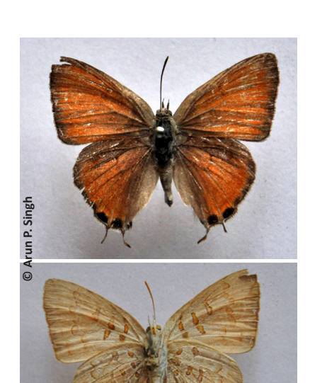
Image 15a&b. Redspot Zesius chrysomallus (Upper side) & (Underside)—Hathibarkala, Dehradun Valley