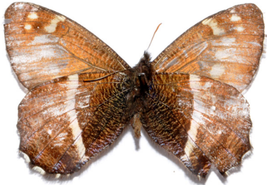
Image 22a&b. Narrow-banded Satyr Aulocera brahminus dokwana (Upperside & Underside)—Valley of Flowers National Park Chamoli District