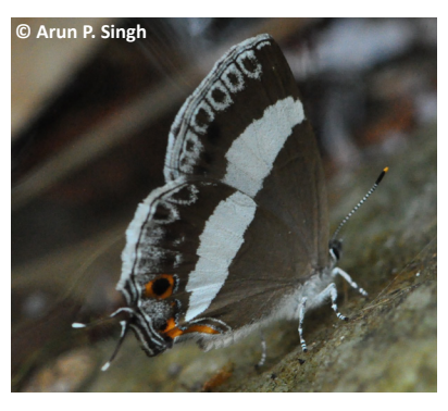
Image 7. Water Hairstreak Euaspa milionia—Kedarnath Musk Deer Reserve