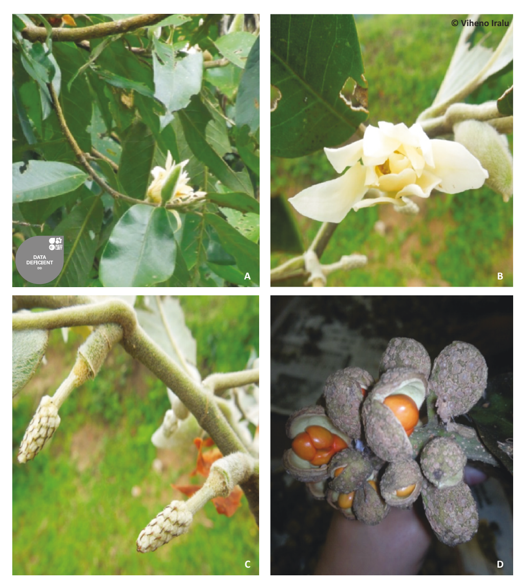
Image 1. Flowering twig (A), flower (B), fruit initiation (C) and mature fruits with seeds (D) of Magnolia lanuginosa

site-III, Pinus kesiya was the dominant tree species followed by Rhododendron arboreum and Lithocarpus dealbatus whereas in site-IV, the associated species includes Schima wallichii , S. khasiana , Pinus kesiya and Castanopsis tribuloides . All the sites were exposed to anthropogenic disturbances, of which site-II and site-III were highly disturbed (Table 1).