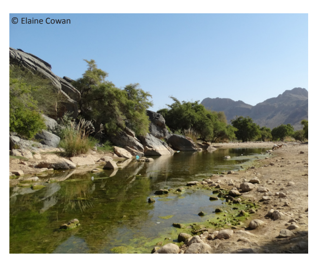
Image 1. The wadi pool study site near Nizwa, northern Oman, 02 January 2014.

dramatically over time due to rainfall, or the lack of it, in the wadi's catchment. The southern and eastern sides of this apparently permanent pool are a popular picnic site especially at weekends.