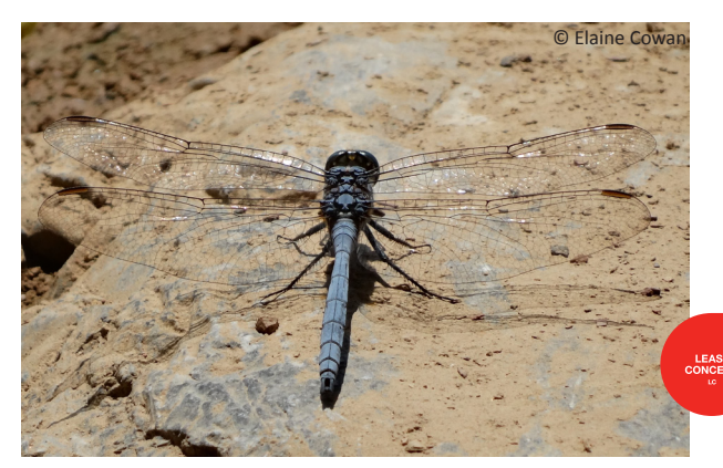
Image 14. Male Orthetrum chrysostigma, 31 March 2014. Blue eyes, blue/black legs, blue thorax. Blue abdomen 'waisted' near base