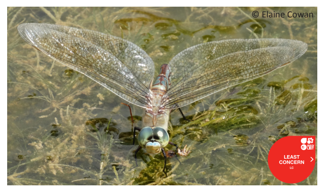
Image 8. Female Anax imperator egg-laying, 16 November 2013. Blue on frons and bluish-green eyes. Wings tinged brown. Blue on abdomen.