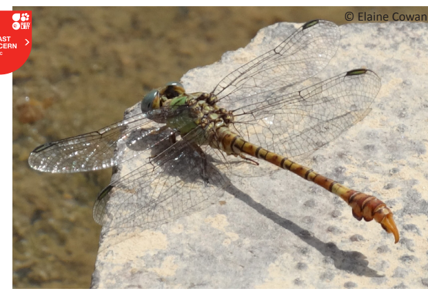
Image 11. Male Paragomphus genei , 5 May 2014. Greenish-blue eyes, green thorax with narrow brown lines, straw and sandy coloured abdomen with brown and black markings and hooked terminal appendages. Dark pterostigmas with light centre