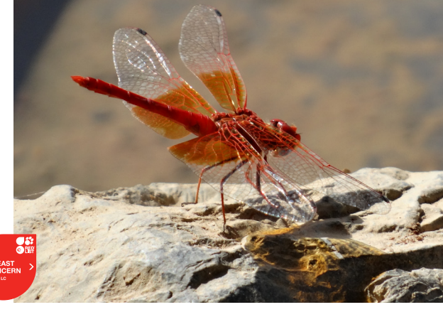
Image 28. Male Trithemis kirbyi , 24 May 2014. Reddish-orange with large orange wing patches.