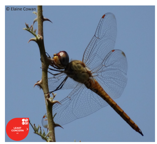
Image 31. Male Pantala flavescens , 1 September 2013 (photographed at silt flat above the pool, 23°05.37′N & 57°25.90′E, elevation 1310m). Note hindwing is very broad (to abdominal segment 5) with wavy veins in outer wing and brown wingtips. Long terminal abdominal appendages