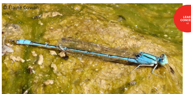
Image 5. Male Pseudagrion decorum , 2 January 2014. Pale blue eyes, blue-greenish antehumeral stripes. Segments 8 and 9 dorsally blue. Rest of abdomen dark above but pale blue on sides below. Light-coloured legs.