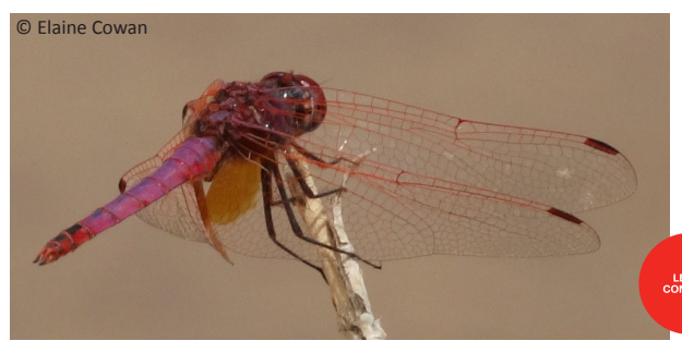
Image 24. Male Trithemis annulata , 23 April 2014. Dark red eyes, red veins on wings with large amber patch at hindwing base. Purplish abdomen with dorsal blackish markings. This male still has some red coloration on abdomen.