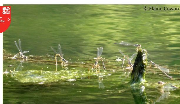
Image 4. Group of presumed female Ischnura evansi , some egglaying, 7 October 2013.