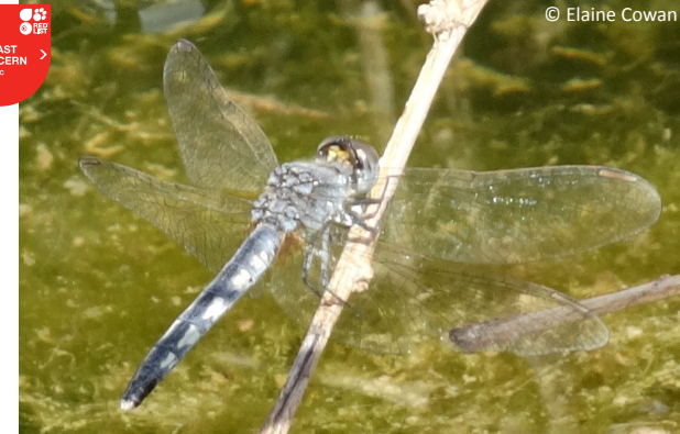
Image 23. Female Diplacodes lefebvrii resting after egg laying, 16 November 2013. Pale abdomen with heavy black markings. Small yellowish-brown patch at hindwing base.