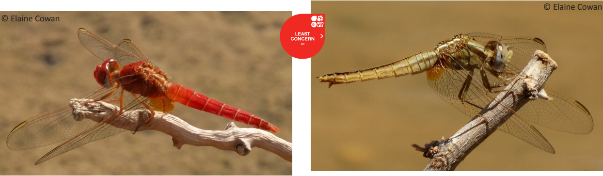
Image 18. Male Crocothemis erythraea , 2 June 2014. Scarlet with broad abdomen with no black markings. Eyes bluish below. Reddish legs. Amber patch at wing bases and long pale pterostigmas.