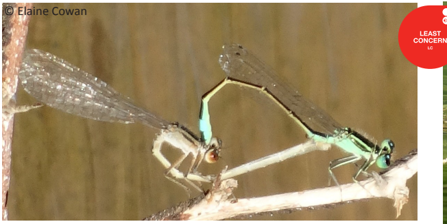
Image 3. Ischnura evansi mating wheel, 12 March 2014. Female brownish with small humeral black stripes and abdomen lighter ventrally. Image rotated 90^\circ right.