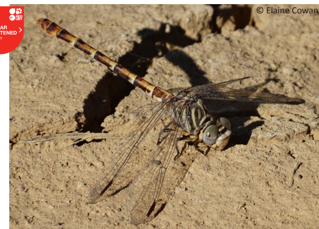
Image 13. Female Paragomphus sinaiticus , 17 May 2014. Abdomen less clearly marked than male, sandy and cream coloured with dark brown and light rings. No terminal appendage hooks