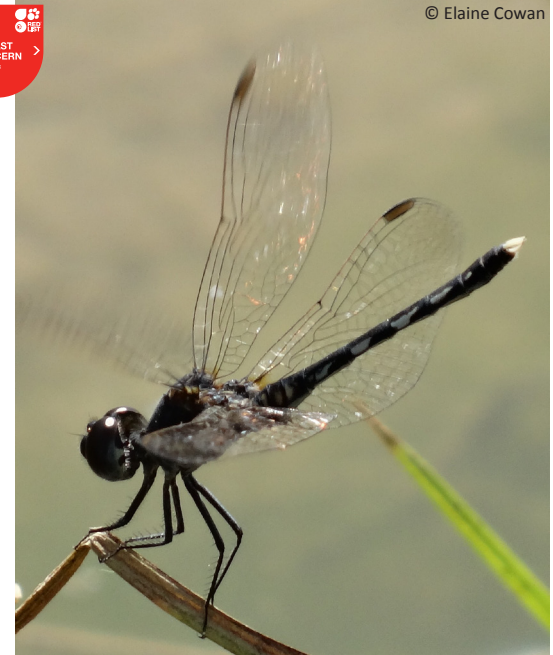
Image 21. Male Diplacodes lefebvrii , 25 September 2013. Small with black frons. Small brown patch at base of hindwing. Black and whitish abdomen. Terminal abdominal appendages white