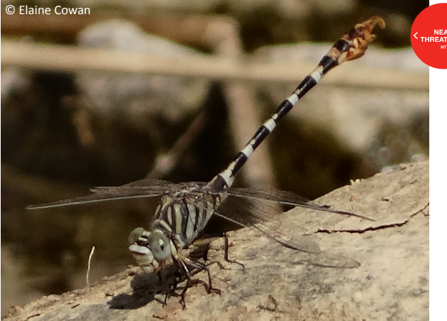
Image 12. Male Paragomphus sinaiticus , 12 March 2014. Greyish eyes, pale frons, grey thorax with black stripes, black and whitish banded abdomen with hooked terminal appendages.