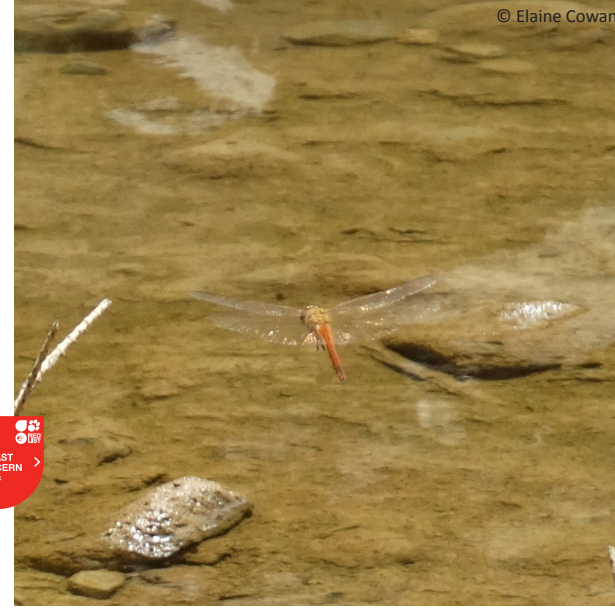
Image 30. Male Pantala flavescens , 2 June 2014. Orange-yellow abdomen and long broad hindwings.