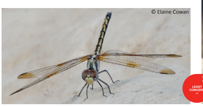
Image 27. Female Trithemis arteriosa , 28 May 2014. Slender blacksided abdomen. Amber apical, nodal and basal patches on wings.