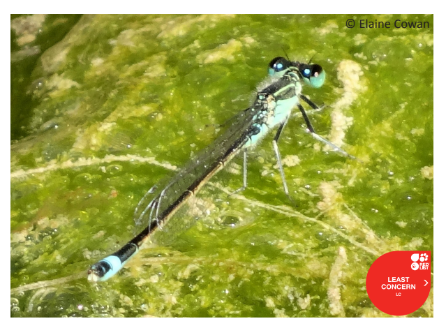
Image 2. Male Ischnura evansi , 4 January 2014. Greenish-blue face, postocular spots and thorax with visible antehumeral stripes. Abdomen dark above and paler below. The black pattern on the top of the second abdominal segment does not extend as a black saddle on the sides, which are greenish. The posterior 'tail-light' on abdominal segment 8 extends all around the abdomen

Our phenological and reproductive behaviour data suggest that there is a core odonate community at the pool consisting of eight permanently resident species, each present on over 70% of our visits. This comprises two coenagrionid species (Ischnura evansi, Pseudagrion decorum) and Anax imperator, Orthetrum chrysostigma, O. sabina, Crocothemis erythraea, Trithemis annulata and T. kirbyi. Other species were recorded on less than 50% of visits and could represent nomadic (wanderer or migrant) individuals, although opportunistic egglaying may occasionally occur. Paragomphus sinaiticus