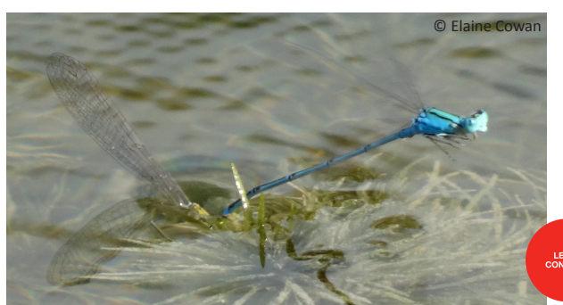
Image 7. Pseudagrion decorum pair in tandem, egg-laying female almost totally submerged, 16 November 2013