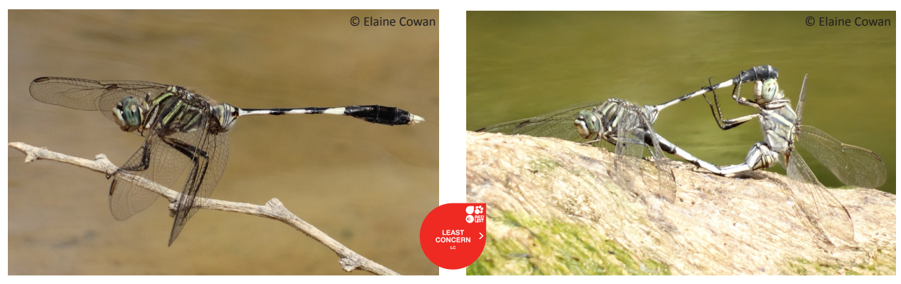
Image 16. Male Orthetrum sabina , 5 June 2014. Greenish eyes and striped thorax. Black and white abdomen terminally club-shaped with white terminal appendages