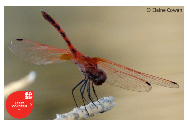
Image 26. Male Trithemis arteriosa , 28 May 2014. Red wing-veins and black legs. Slender red abdomen with lateral black markings. Large amber patch at hindwing base.