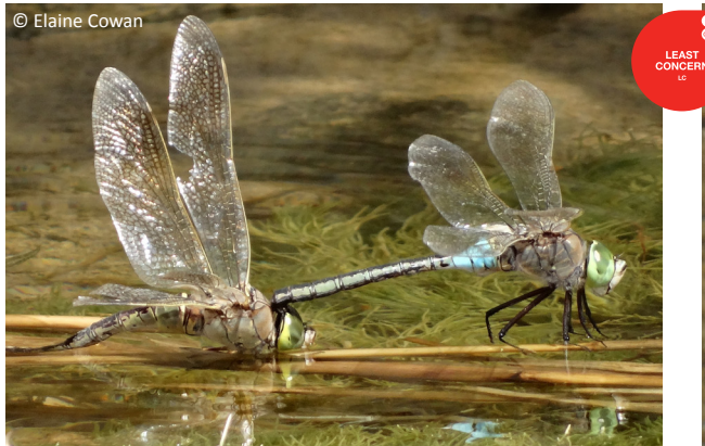
Image 10. Anax parthenope egg-laying in tandem, 10 March 2014. Male: green eyes, brown thorax, blue saddle around abdominal segments 2 and 3. Female: eyes above green with yellow below, brown thorax, yellowish band near base of abdomen.