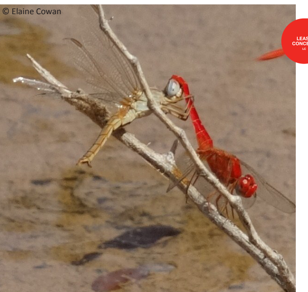
Image 20. Crocothemis erythraea pair separating from mating wheel, 5 June 2014. Note vulvar scale near tip of female's abdomen (also visible in Image 19).