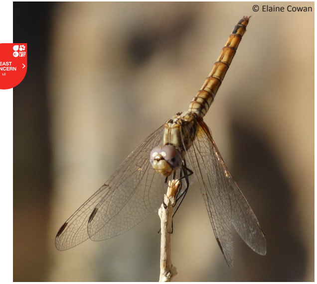
Image 25. Female Trithemis annulata , 9 April 2014. Yellowish-brown abdomen with dorsal line and thick black bar on segments 8 and 9. Amber patch at hindwing base.