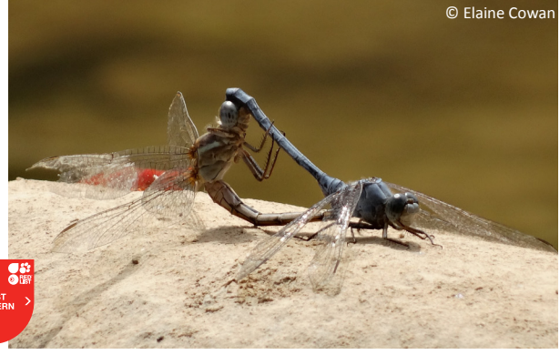
Image 15. Orthetrum chrysostigma mating wheel, 23 April 2014. Female brown with a lateral whitish dark-bordered thoracic stripe.