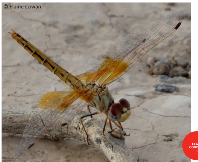
Image 29. Female Trithemis kirbyi , 28 May 2014. Black dashes along abdomen sides and two dorsal dashes at segments 8 and 9. Extensive orange on wings and short dark pterostigmas.