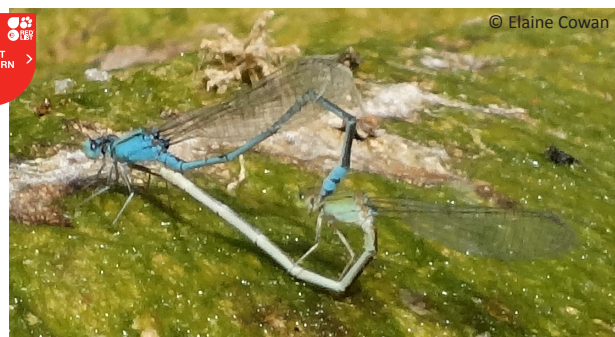
Image 6. Pseudagrion decorum mating wheel, 24 December 2013. Female: greenish face and upper thorax; underside of abdomen, lower face and lower sides of thorax pale blue-grey