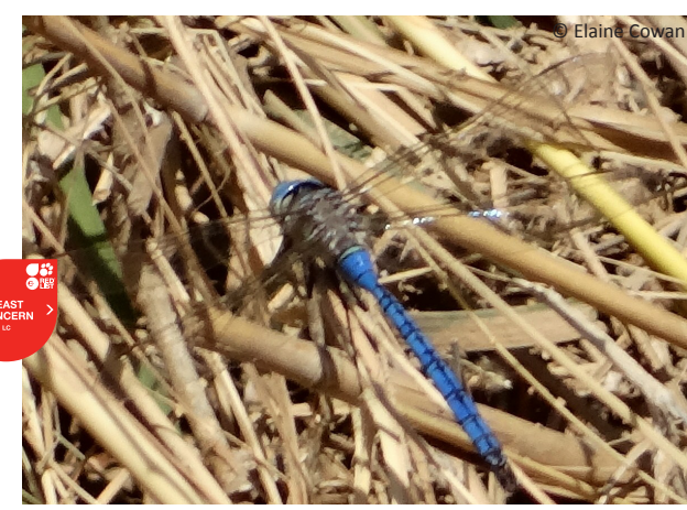
Image 9. Male Anax imperator , 2 January 2014. Blue eyes, bright blue abdomen.