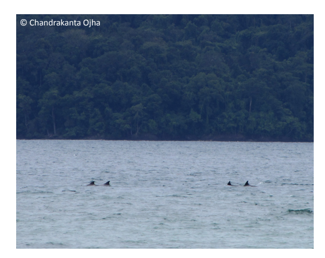
Image 1. Photograph showing dorsal fins of four individuals of dolphins at the backdrop of Ruthland Island, as viewed from Mundapahad Beach

Sighting 1 (Image 1): On 9 September 2013 during a regular survey of coral reefs to Chidiyatapu (Mundapahad Beach) a pod of dolphins numbering 12–14 individuals was observed. The sighting occurred while the survey team was at the beach. At around 12:10 hr the pod was seen just outside the coral reef in front of the beach. The coral reef in Chidiyatapu is situated at a distance of about 225m from the beach. The direction of their travel was from north-west to south-east of the islands.