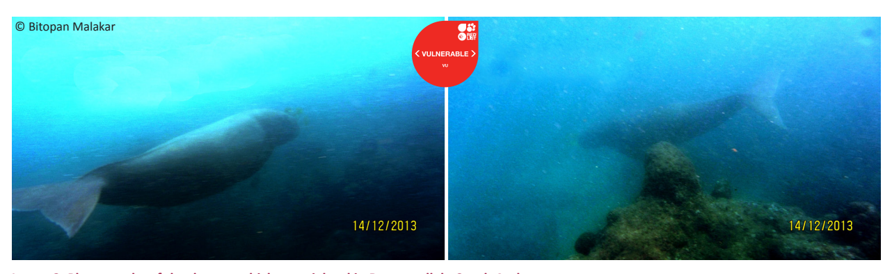
Imgae 2. Photographs of the dugong which was sighted in Burmanullah, South Andaman