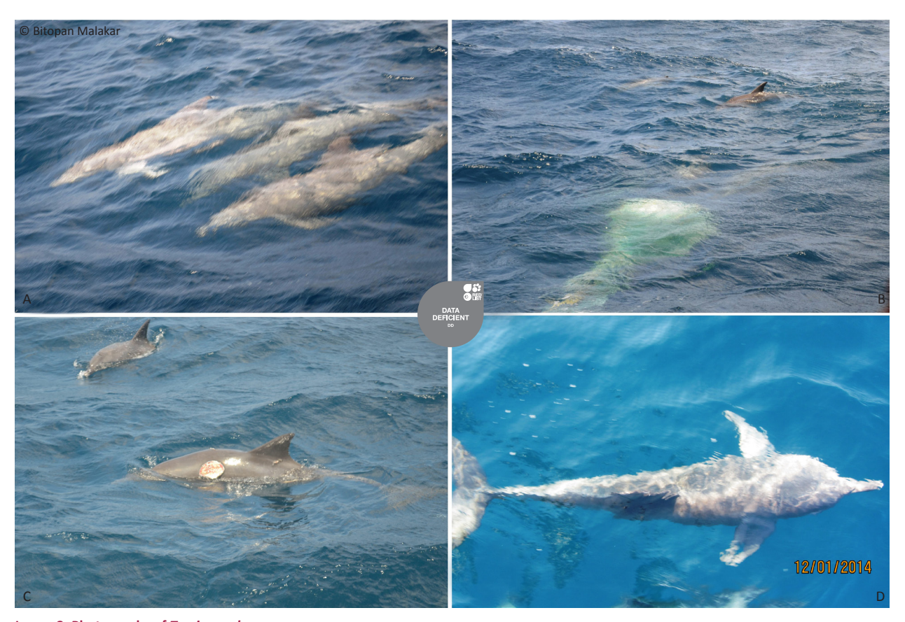
Image 3. Photographs of Tursiops aduncus A - Four individuals swimming together at the surface; B - Few individuals seen chasing the cod end of the trawl net while hauling; C - The injured adult individual along with another individual; D - A younger individual as seen while bow riding

observed were bow-riding, wake-riding and frequent breaching as described by Carwardine (1995). Bow riding (jumping and swimming just in front of the trawler) by two individuals one of which was a younger individual was observed on 12 January 2014. The conclusion that the sighting was of the same pod is due to two reasons. First, the pod was sighted repeatedly in the same area north east off Kyd Island. Second, an adult individual