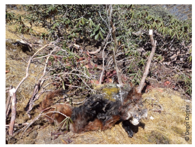
Image 2. The Red Panda accidentally caught in a snare near Kemala Tso

is interesting to note such a long transit undertaken by this particular animal, that too during the early winter months. Extensive seasonal field data on Red Panda presence throughout the CCA will be able to provide a conclusive verdict on the elevation range favoured by the Red Pandas in the area. While such incidences of casualty can be considered as a potential threat to the Red Pandas in this region, as reported, the cases are extremely sporadic and localised. With the community members being closely involved in the management of Pangchen Lumpo Muchat Community Conserved Area (PLUMCCA) and mitigation of threats to Red Panda and other wildlife, even incidences of hunting in the fragile high altitude ecosystem under their guardianship are very rare.