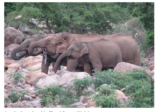
An elephant herd in Theni Forest Division