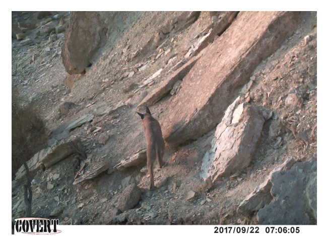
Image 3. Caracal captured by a camera trap on 22.ix.2017 on Ustyurt Plateau in Uzbekistan.

dozen kilometres" from the village of Turtkul in 2006. In October 2013, he also saw a Caracal by day near the town of Gazli, and another one in the autumn of the same year not far from lake Dengizkul (Gritsina et al. 2016).