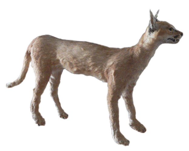
Image 1. Stuffed Caracal exhibited in the Museum of Nature at the Kyzylkum State Reserve in Uzbekistan.

In the Kyzylkum area, we interviewed 245 people in five villages and in more than 40 locations. Villagers of Kalaata in central Kyzylkum reported a Caracal killed by herders on 20 March 2014 about 20km southwest of the