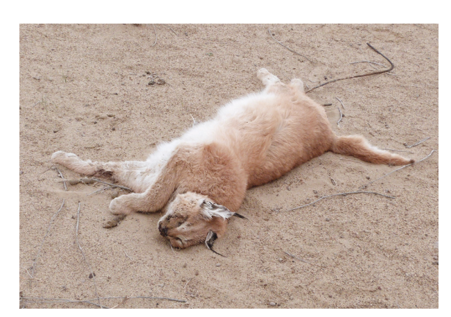
Image 2. The carcass of a young female found in Kyzylkum Desert in Uzbekistan on 20.iii.2014. © M. Gritsina.