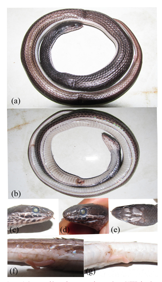
Image 1. Psammophis condanarus voucher specimen BLT77 showing (a) entire dorsal, (b) ventral, (c) head right side, (d) head left side, (e) head top view, (f) hemipenis asulcate view, (g) hemipenis sulcate view.